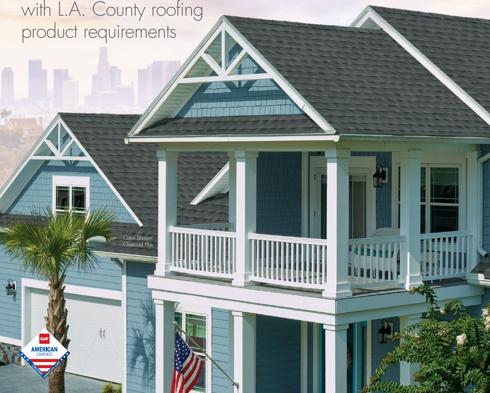
Color Shown: Charcoal Plus

can be used to comply with L.A. County roofing product requirements