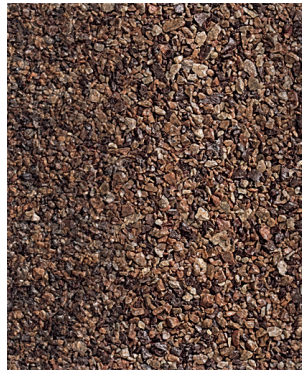
DECRA TILE Chestnut