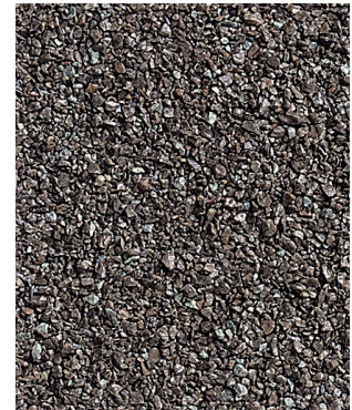
DECRA TILE Granite Grey