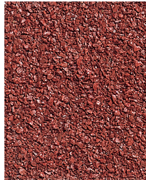
DECRA TILE Garnet