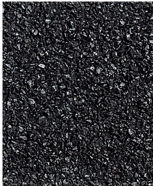
DECRA TILE Charcoal