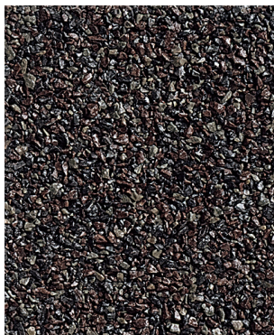
DECRA TILE Shadowood