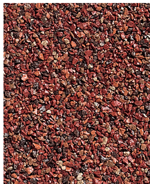
DECRA TILE Terracotta