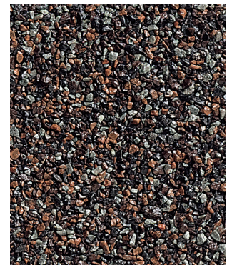
DECRA TILE Weathered Timber