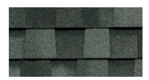
Max Def Granite Gray