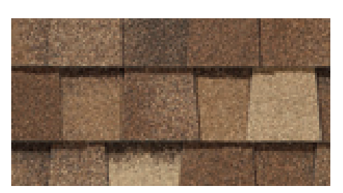
Max Def Resawn Shake