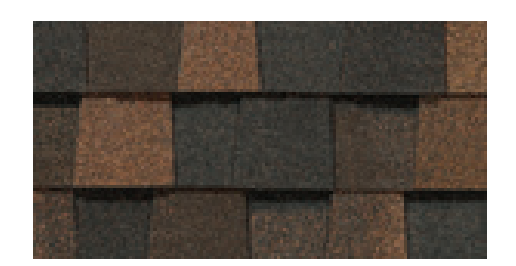
Max Def Burnt Sienna