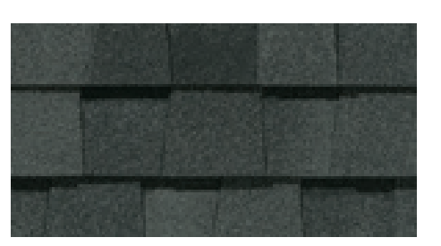
Max Def Moire Black