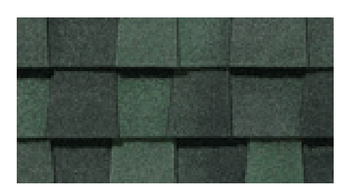
Max Def Hunter Green