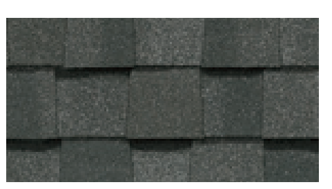
Max Def Pewter