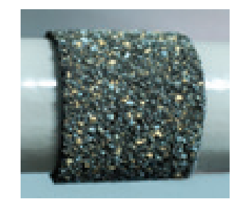
SBS-modified asphalt shingle with no cracking