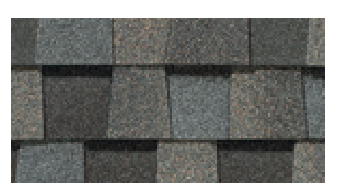
Max Def Weathered Wood