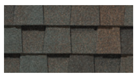
Max Def Heather Blend